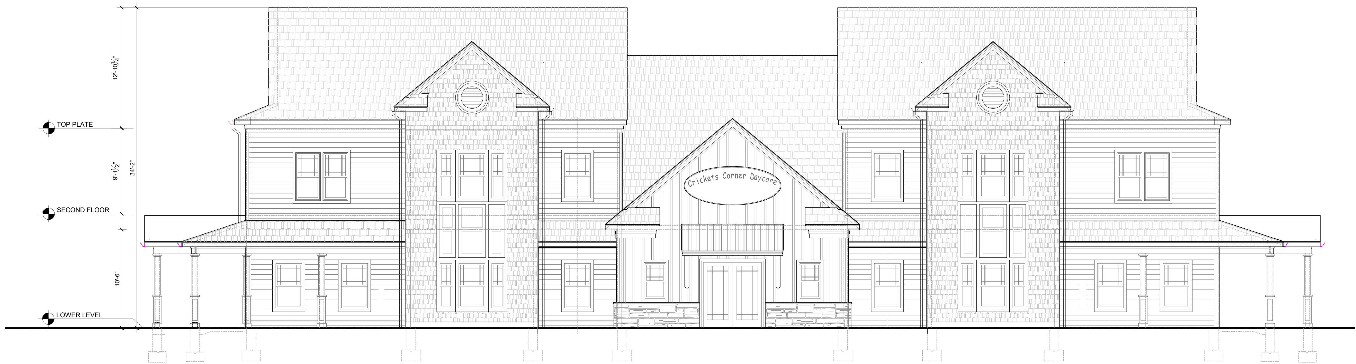
1 FRONT ELEVATION 3/16" = 1'-0"