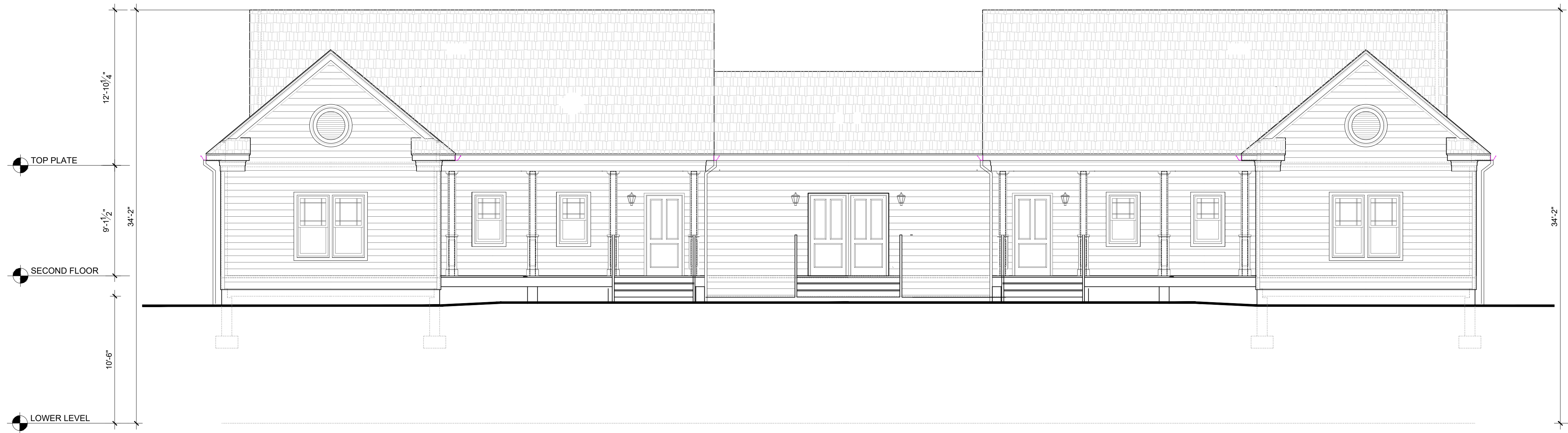
1 BACK ELEVATION 3/16" = 1'-0"