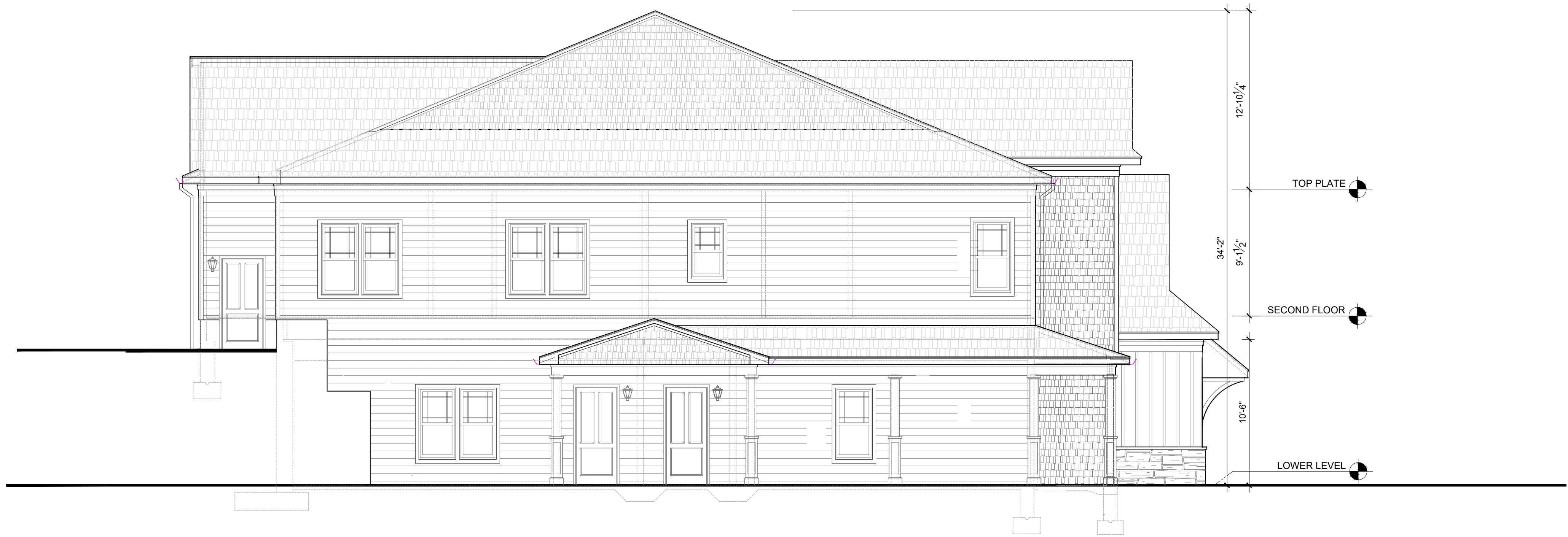
2 LEFT SIDE ELEVATION 3/16" = 1'-0"