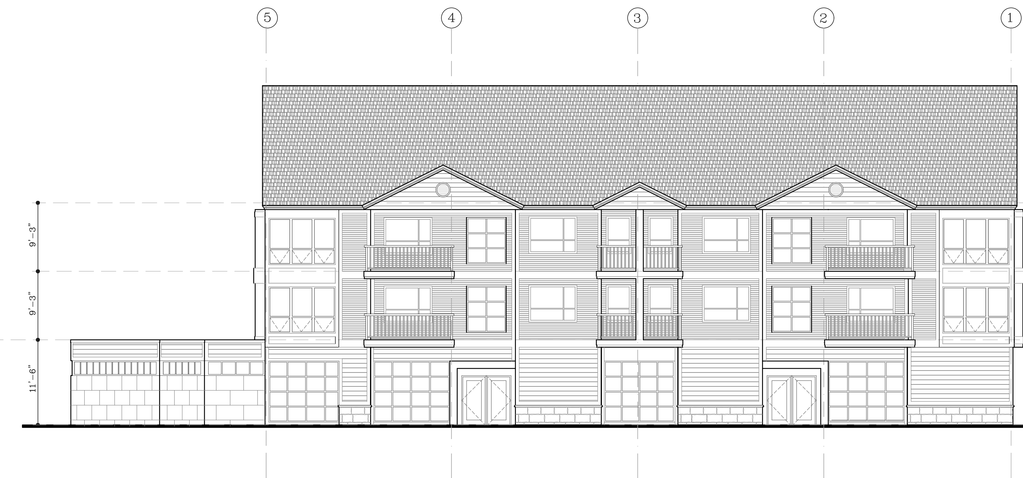
3 EAST ELEVATION SCALE: 1/8" = 1'0"