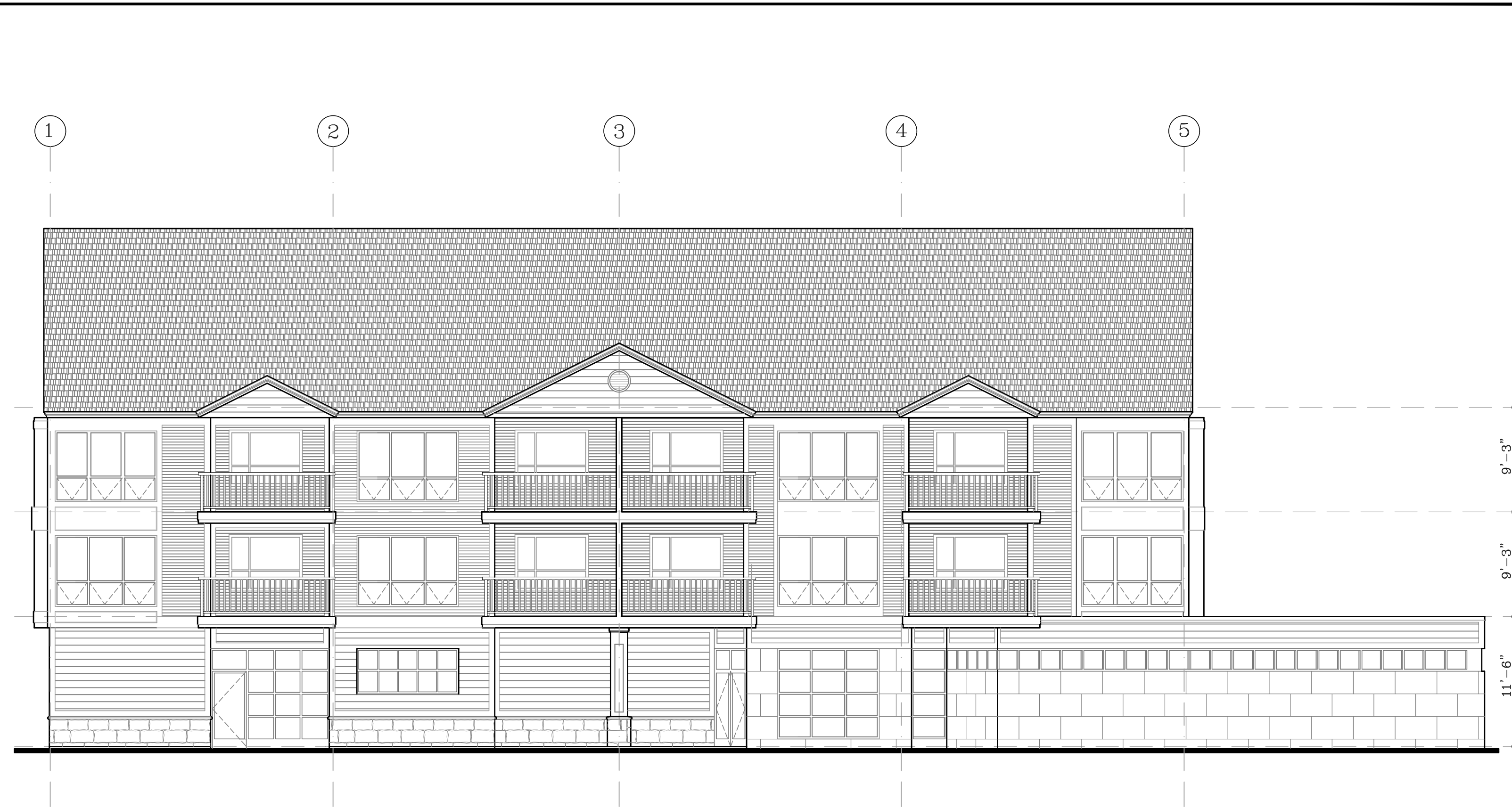
1 WEST ELEVATION SCALE: 1/8" = 1'0"