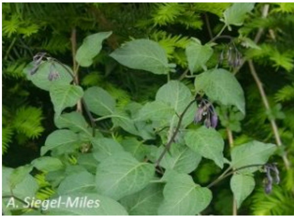
Solanum dulcamara – Bittersweet nightshade (P)