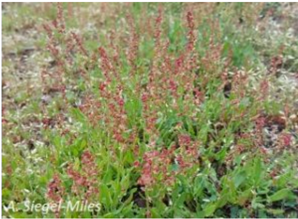
Rumex acetosella – Sheep sorrel (P)