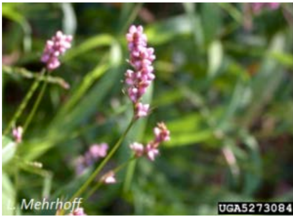
Polygonum caespitosum – Bristled knotweed