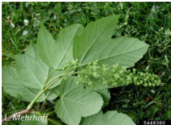
Acer pseudoplatanus – Sycamore maple (P)