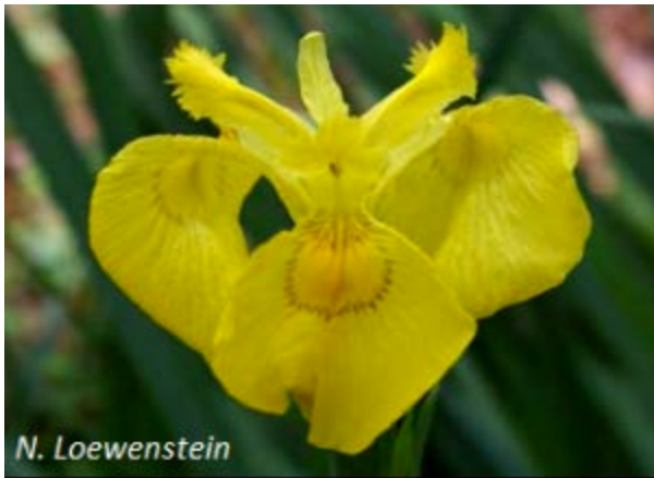
Iris pseudacorus – Yellow iris