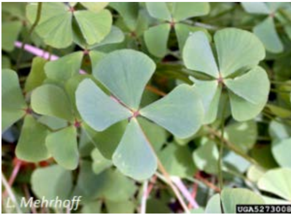
Marsilea quadrifolia – European waterclover (P)