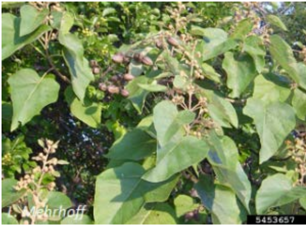
Paulownia tomentosa – Princess tree (P)