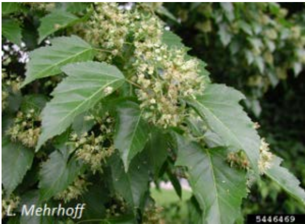
Acer ginnala – Amur maple (P)

Click here to view the list sorted by COMMON NAME