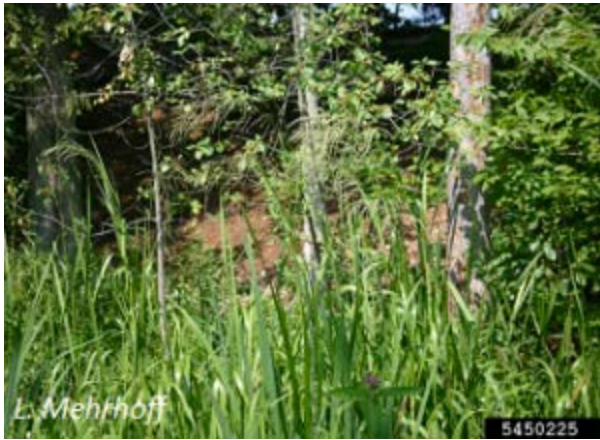
Glyceria maxima – Reed mannagrass (P)