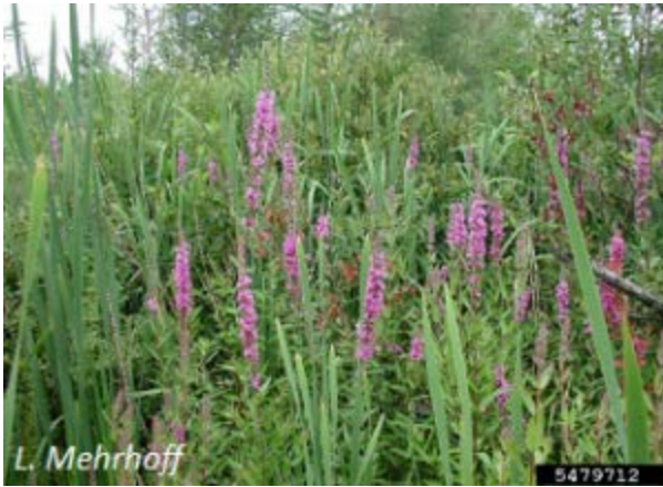
Lythrum salicaria – Purple loosestrife