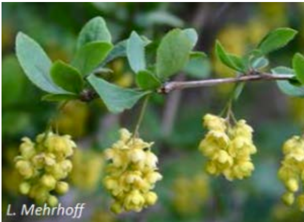
Berberis vulgaris – Common barberry