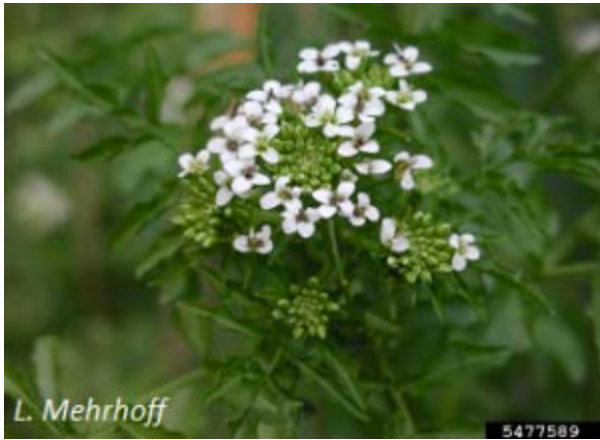
Nasturtium officinale – Watercress (P)