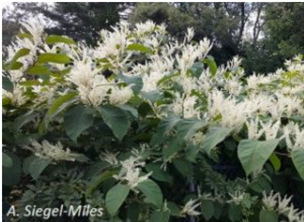
Polygonum cuspidatum – Japanese knotweed (syn. Reynoutria japonica and Fallopia japonica)