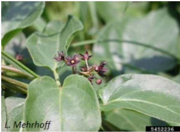
Cynanchum louiseae – Black swallow-wort (syn. Vincetoxicum nigrum)