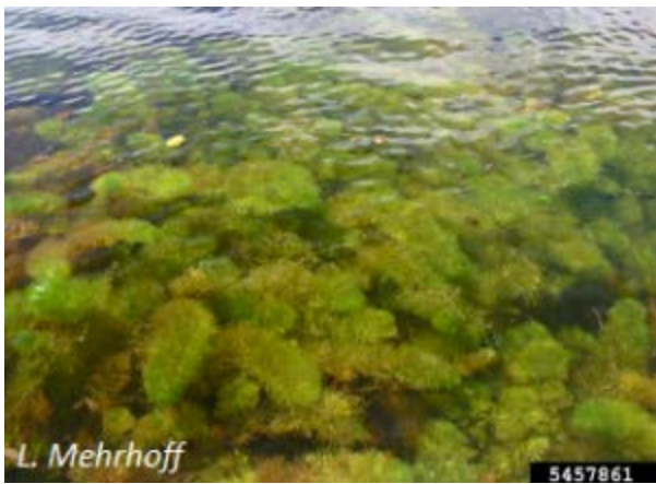
Myriophyllum heterophyllum – Variable-leaf watermilfoil