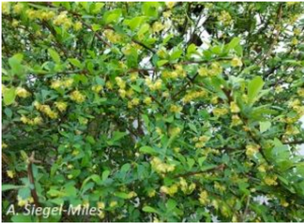
Berberis thunbergii – Japanese barberry