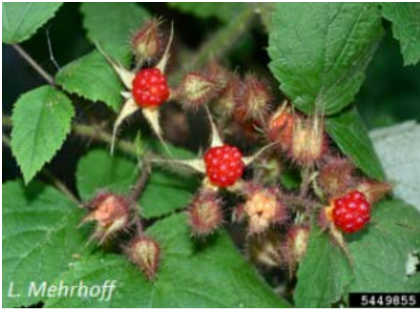
Rubus phoenicolasius – Wineberry