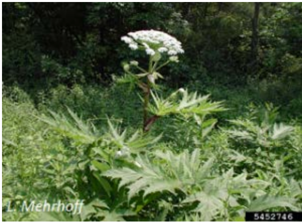
Heracleum mantegazzianum – Giant hogweed (P)