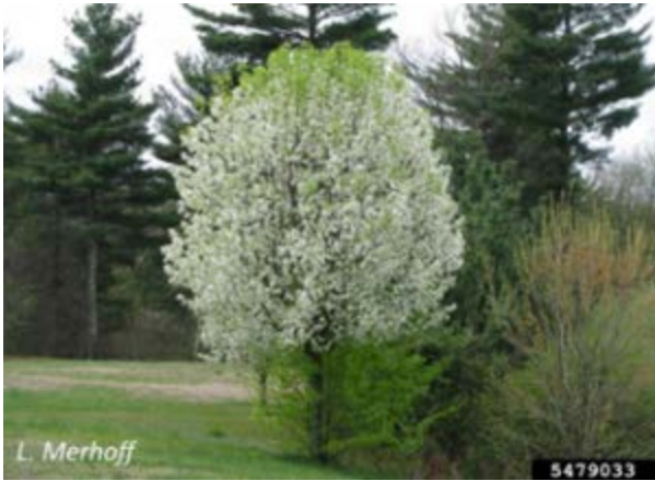
October 2027: Callery pear – Pyrus calleryana