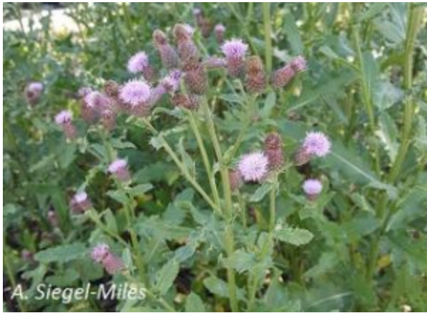
Cirsium arvense – Canada Thistle (P)