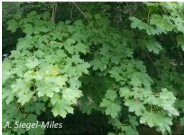
Acer platanoides – Norway maple