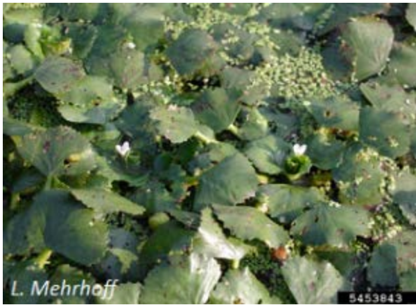
Trapa natans – Water chestnut