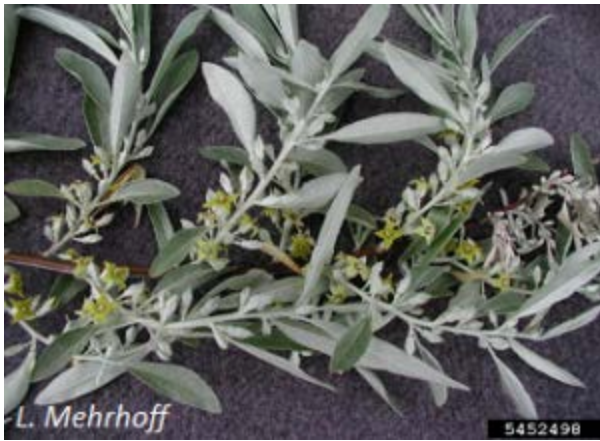
Elaeagnus angustifolia – Russian olive (P)