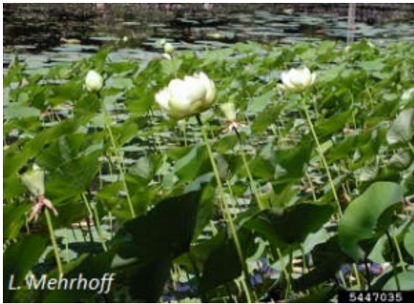
Nelumbo lutea – American water lotus (P)