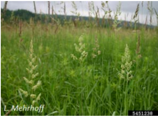
Phalaris arundinacea – Reed canary grass