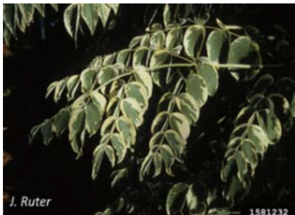
Japanese angelica tree – Aralia elata

Added to Invasive Plant List May 14, 2024; Prohibition from importation, movement, sale, purchase, transplanting, cultivation and distribution effective October 1, 2024 (under CT General Statutes Public Act No. 24-11 .pdf 🔗 ):