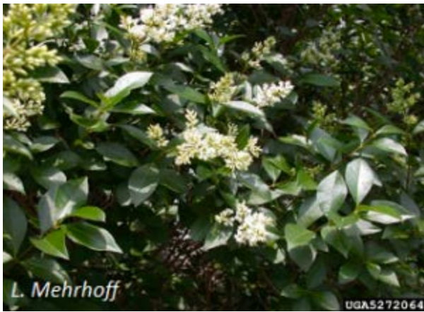
Ligustrum vulgare – European privet (P)