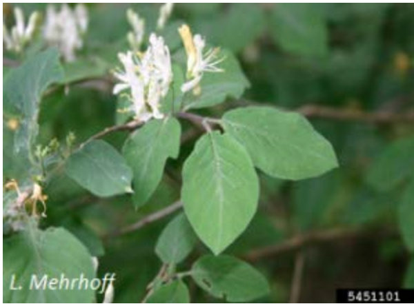
Lonicera xylosteum – Dwarf honeysuckle (P)