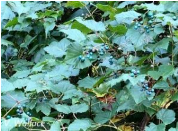
Ampelopsis brevipedunculata – Porcelainberry