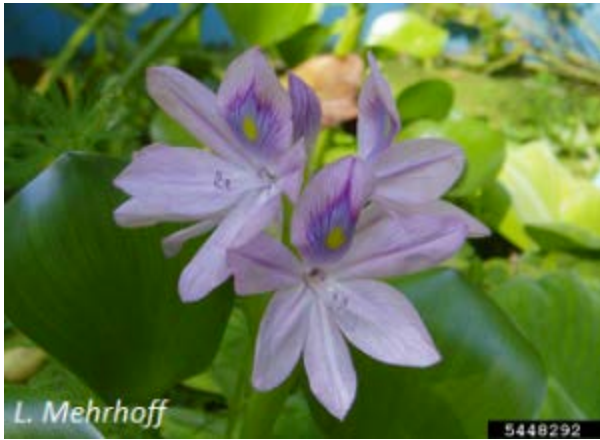
Eichhornia crassipes – Common water-hyacinth (P)