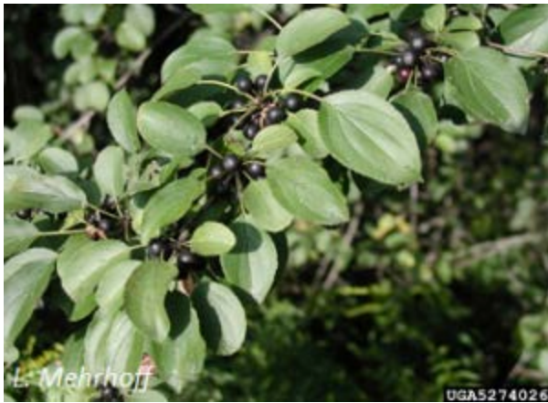
Rhamnus cathartica – Common buckthorn