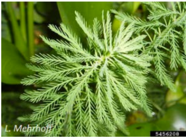
Myriophyllum aquaticum – Parrotfeather (P)