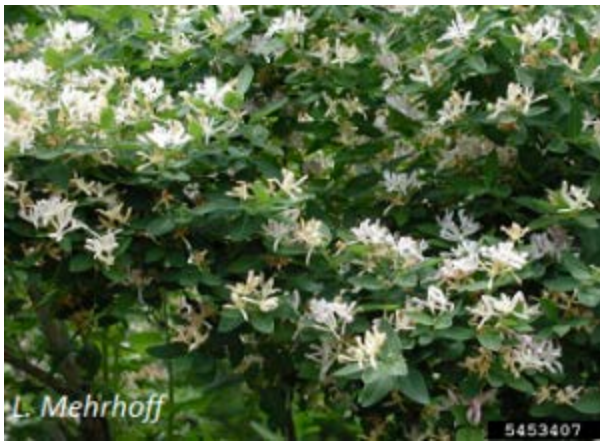
Lonicera x bella – Belle honeysuckle