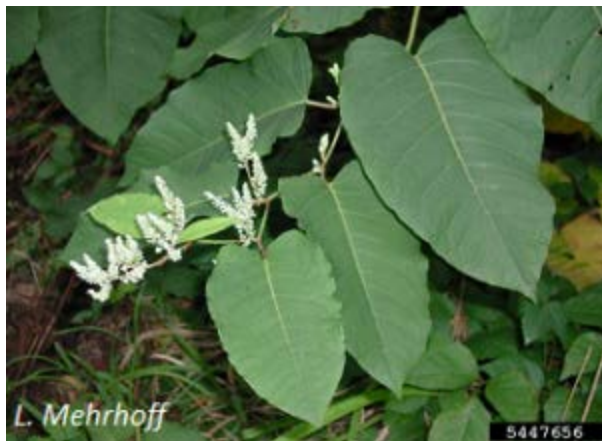
Polygonum sachalinense – Giant knotweed (P)