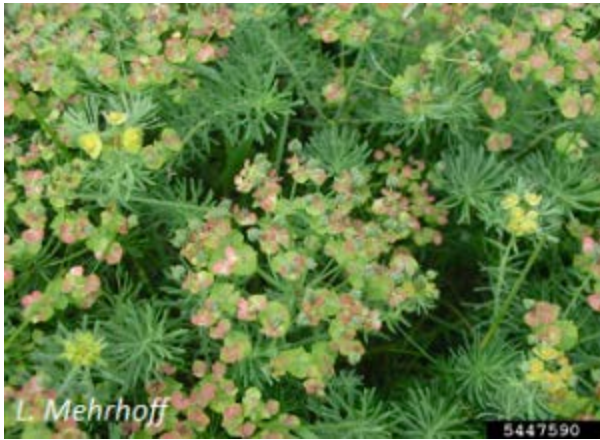
Euphorbia cyparissias – Cypress spurge (P)