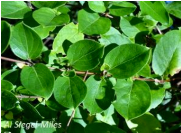
Lonicera japonica – Japanese honeysuckle