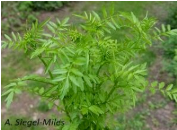
Cardamine impatiens – Narrowleaf bittercress