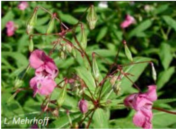
Impatiens glandulifera – Ornamental jewelweed (P)