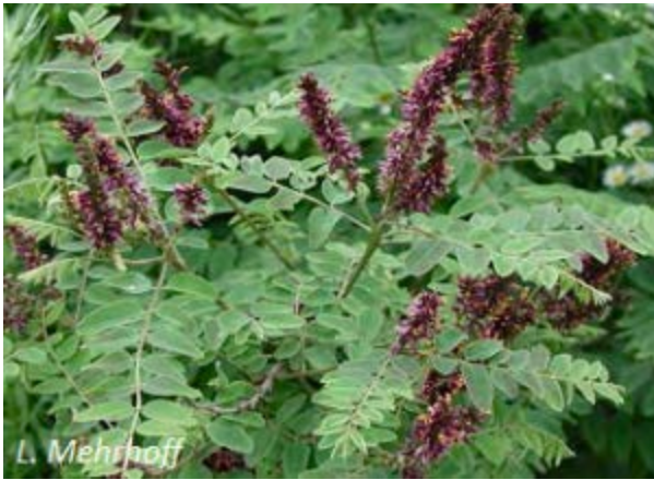
Amorpha fruticosa – False indigo (P)