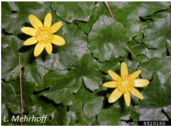
Ranunculus ficaria – Fig buttercup (syn. Ficaria verna)