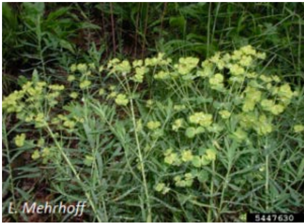
Euphorbia esula – Leafy spurge