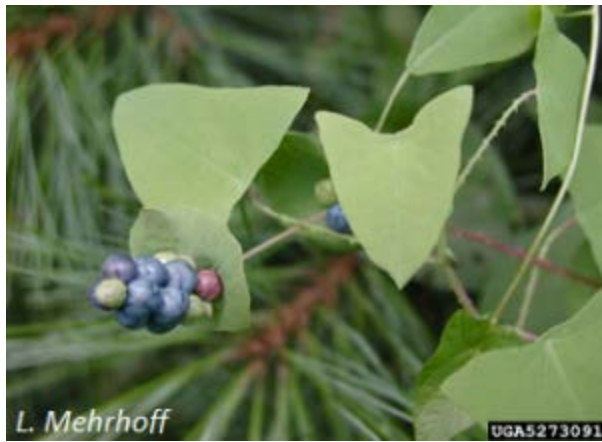
Polygonum perfoliatum (Persicaria perfoliata) – Mile-a-minute vine