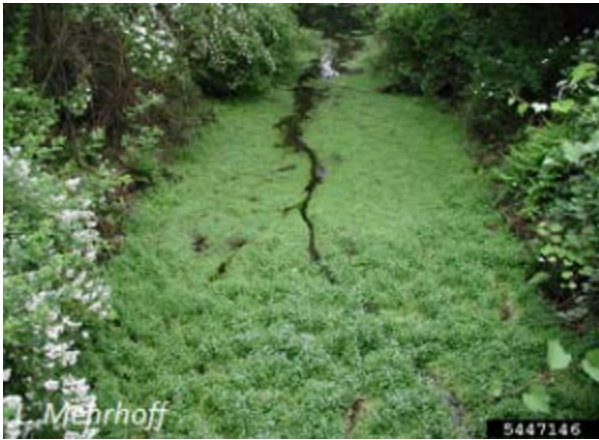
Callitriche stagnalis – Pond water-starwort (P)