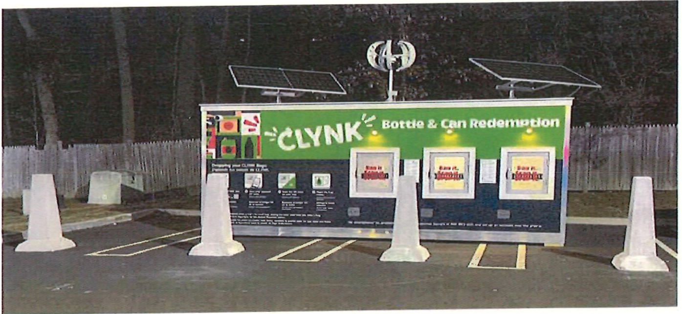
IMAGE AND SPECIFICATIONS OF TYPICAL REDEMPTION STATION

Placement of an 8' x 32' CLYNK Sustainability Station in the parking lot, requiring the use of 5 parking stalls.